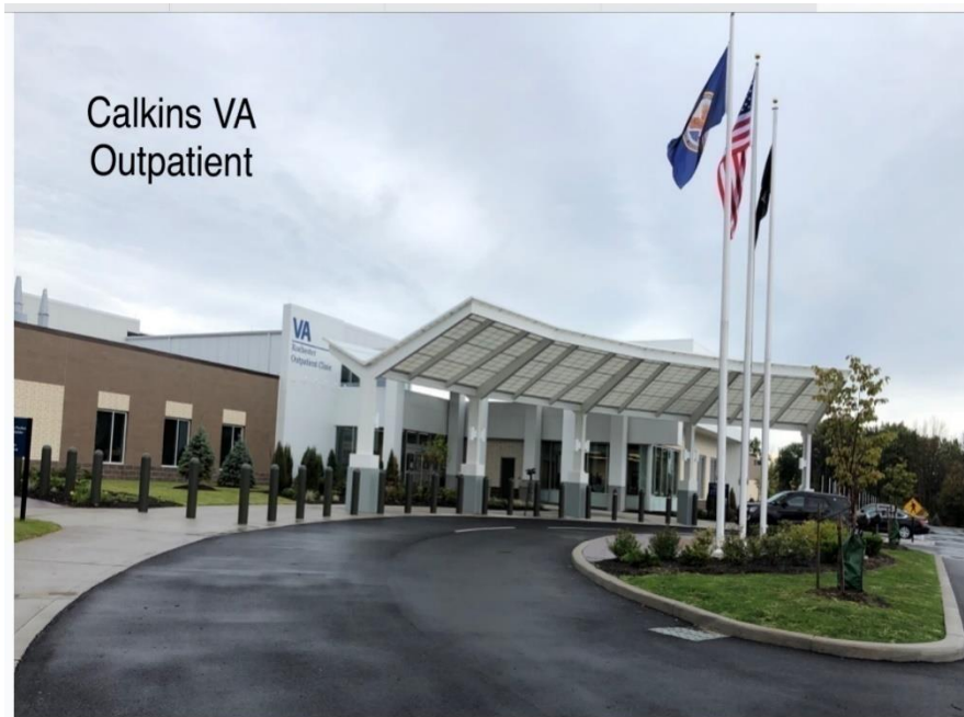
Calkins VA Outpatient

Rochester Calkins VA Clinic 260 Calkins Road Rochester, NY 14623 585 463- 2600